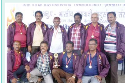
Volley Ball (Shooting) Team

A 44-member CTRI Sports and Games contingent participated in the ICAR Inter-Institutional Sports Meet held at IIHR, Bangalore during 13-17 October, 2014. CTRI secured 1st place in the Volley Ball (Shooting) event.